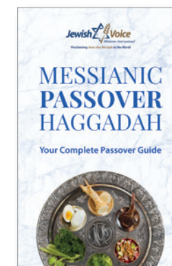
Messianic Passover Haggadah