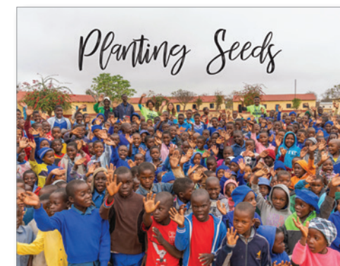
Planting Seeds (Zehra Kids Program photobook)