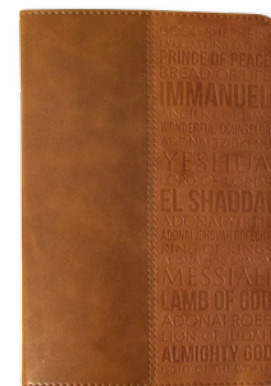
Names of God Journal