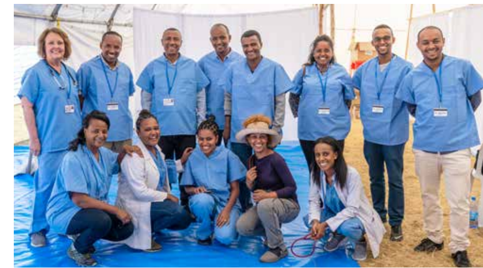
God worked in a big way to deliver medical care to record numbers of patients in Ambo Meda, Ethiopia – the most in Jewish Voice history!

Last year, in Debre Birhan, Ethiopia, Jewish Voice conducted an Outreach that broke the records to date when