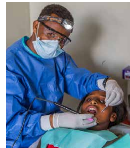
Our JVMI team of Outreach Partners are dedicated to delivering quality medical care in the name of Yeshua.

It makes sense, then, that as JVMI seeks to heal physical wounds and bring peace and comfort to people on our Outreaches, Satan would be angered. We know that the rulers, powers, and worldly forces of darkness are working against us at every turn to disrupt the work we do (Ephesians 6:12). But the stakes are even higher than that. Because we don't offer physical aid and then leave – we offer living water, too: the chance to know Yeshua as Messiah. There is nothing in this world that angers Satan more.